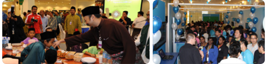
Left: Intel Spreads Festive Cheer Right: Sponsors of Tomorrow