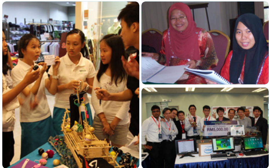
Clockwise from left: Business as Usual / Class is in Session / Operation Innovation Accomplished