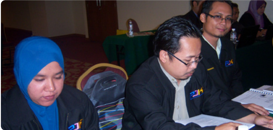
Above: Representatives from MSD Digital Intelligence at the Intel® Easy Steps program training session. Right: Class is in session! Sixty Community Broadband Center managers on their way to becoming Intel® Easy Steps Senior Trainers.

Conducted in two batches, the Senior Trainers were given an in-depth training of the program through hands-on activities and activity cards. The training session was also witnessed by officials from MSD Digital Intelligence - Intel Malaysia's partner in the Intel Easy Steps Program.