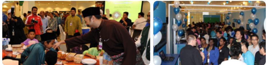
Left: Intel Spreads Festive Cheer Right: Sponsors of Tomorrow