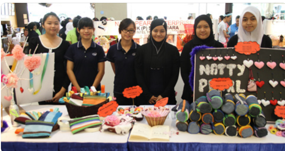
Top: Assorted book marks, zipper bags and flower badges. Above: Well done team Natty Pearl Enterprise! Bottom right: The Young Enterprise (YE) Achievers Sales fair in full swing.

The two-day Sales Fair saw our Young Achievers overcoming entrepreneurial challenges through unique product offerings, creative marketing strategies, combined with a good load of humour.