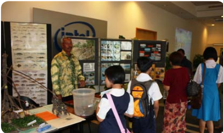
Clockwise from top: An adorable skit by students / Intel staff being briefed / Students viewing 'green' exhibits