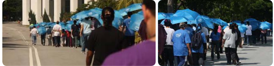
Above: Walk for Life: Staying healthy can be so easy and free