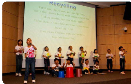
Clockwise from left: Easy Steps towards ICT literacy / Malaysian students innovate their way to victory at Intel ISEF 2011 / Turning trash into cash the Intel way