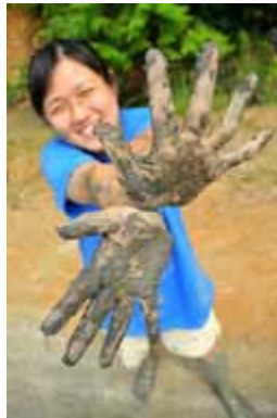
A pair of hands that made a difference to the environment