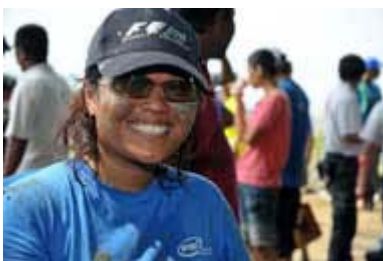
Big smile from one of the Intel volunteers