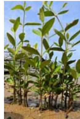
Mangrove trees act as natural barriers to erosions and large tidal waves including tsunamis