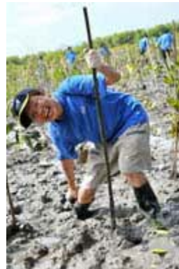
Intel volunteer always ready to get down and dirty for a good cause