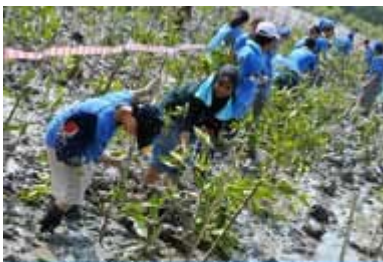
Intel employees determined to clock in to the 1 million hours of volunteer service

An advocator of better health and cleaner environment, Intel spearheaded its fourth mangrove tree planting activity at Kampung Sungai Sembilang, Juru. The project brought together the support of various sections of the community to increase awareness, responsibility and action towards maintaining a healthy and sustainable coastal environment. The project garnered the support of over 400 volunteers and planted a total of 4,000 mangrove saplings.