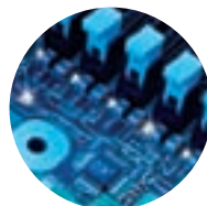
Intel® Light Guided Diagnostics