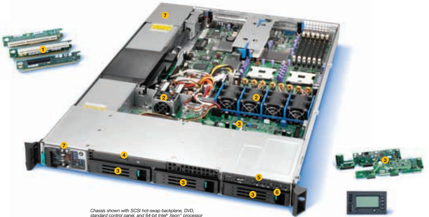
Chassis shown with SCSI hot-swap backplane, DVD, standard control panel, and 64-bit Intel® Xeon® processor