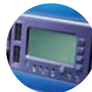
Intel® Local Control Panel