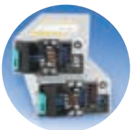
Intel® Power and Thermal Headroom