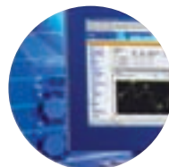
Intel® Power Optimization