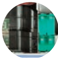
Intel® Active Airflow Control