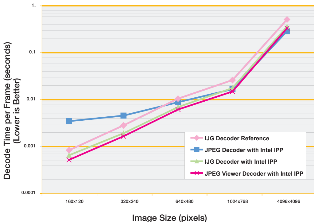
Figure 3. JPEG Decode Performance Results 3

The IJG Decoder with Intel IPP curve (light green line) shows the performance of the IJG implementation with IPP functions substituted for similar components in