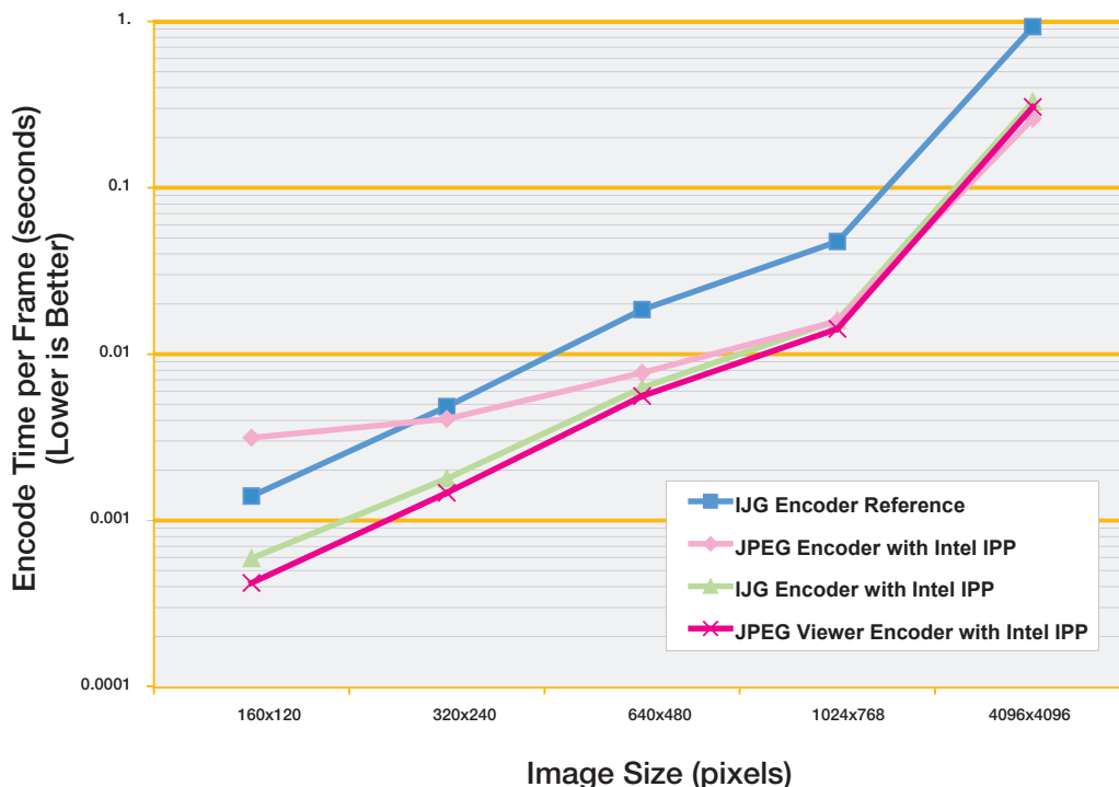
Figure 2. JPEG Encode Performance Results 3

Interestingly, performance varies almost linearly with the size of the image. Web, e-mail, and handheld sizes are represented by 160x120 and 320x240 image tests. 5 High-resolution scanner images are represented by 1024x768 and 4096 (4K) x 4K image tests. 5