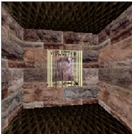
Figure 6: Example of Z-fighting – A Wall and Poster Share a Plane

Figure 6 above demonstrates the type of visual artifact commonly seen when z-fighting occurs. Using the D3DRS_DEPTHBIAS render state in DirectX (D3DRS_ZBIAS on DirectX 8 and earlier) addresses this issue, however, the same visual artifacts can occur on other hardware.