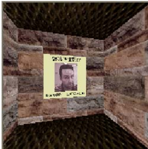
Figure 8: Z-fighting Solved with Projection Modification Solution