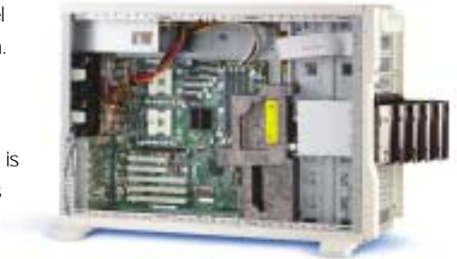
Intel® Server Chassis SC5200

Intel® PRO Server Adapters , including Fast Ethernet and Gigabit Ethernet server adapters, help to reduce bottlenecks and improve availability with industry-leading performance and advanced server features.