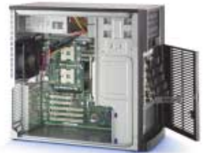
Intel® Server Chassis SC5250-E

Intel server building blocks are validated to work together seamlessly, saving you R&D, validation, and support expenses—and minimizing time to market.