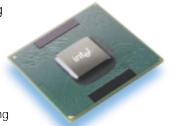
Mobile Intel® Pentium® 4 Processor - M

The new Mobile Intel® Pentium® 4 Processor - M delivers outstanding performance for mobile PCs—the highest performance available in an Intel® mobile CPU—with power saving features to enable long battery life. This advanced mobile processor, together with the Mobile Intel® 845MP chipset, provides a stable platform and OS environment, decreasing deployment time and reducing qualification, support and maintenance costs.