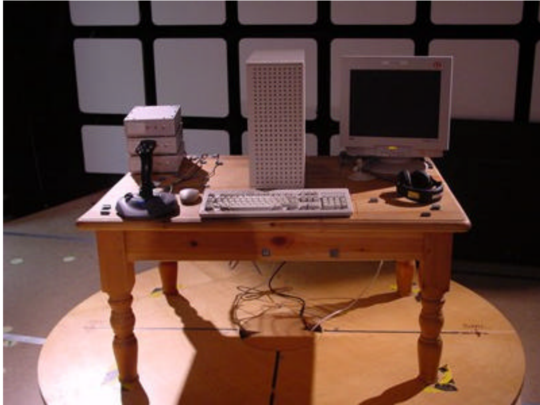
Figure 4-1 Generic test set-up for the Enlightenment EN-7280 ATX Mid Tower Chassis