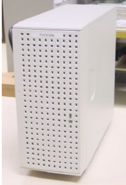
Figure 2-1 Enlightenment EN-7280 ATX Mid Tower Chassis